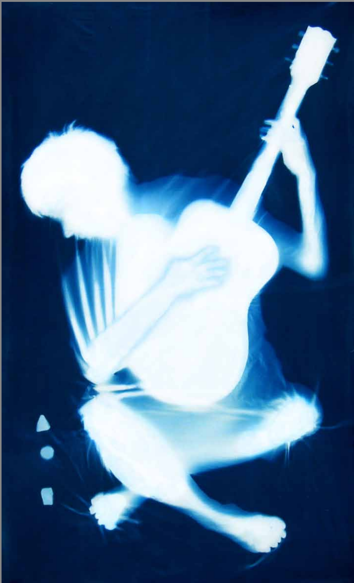
Old Guitarist (after Picasso)