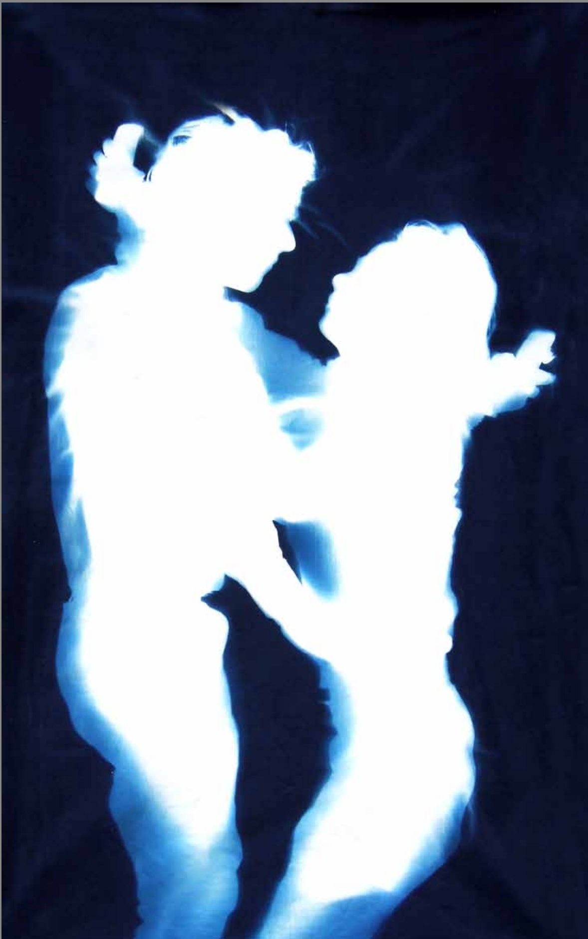
Mobile Lovers (after Banksy)