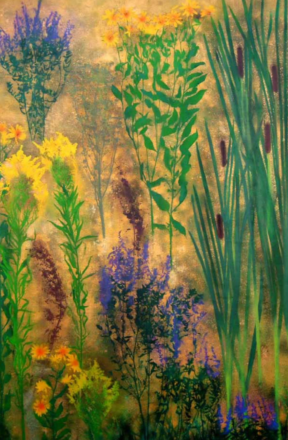
Andrew Owen A01 Don River Wildflowers & Humber River Wildflowers (2 of 9 works from Nine Rivers Romance series)