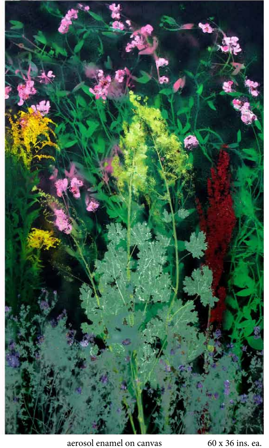
aerosol enamel on canvas